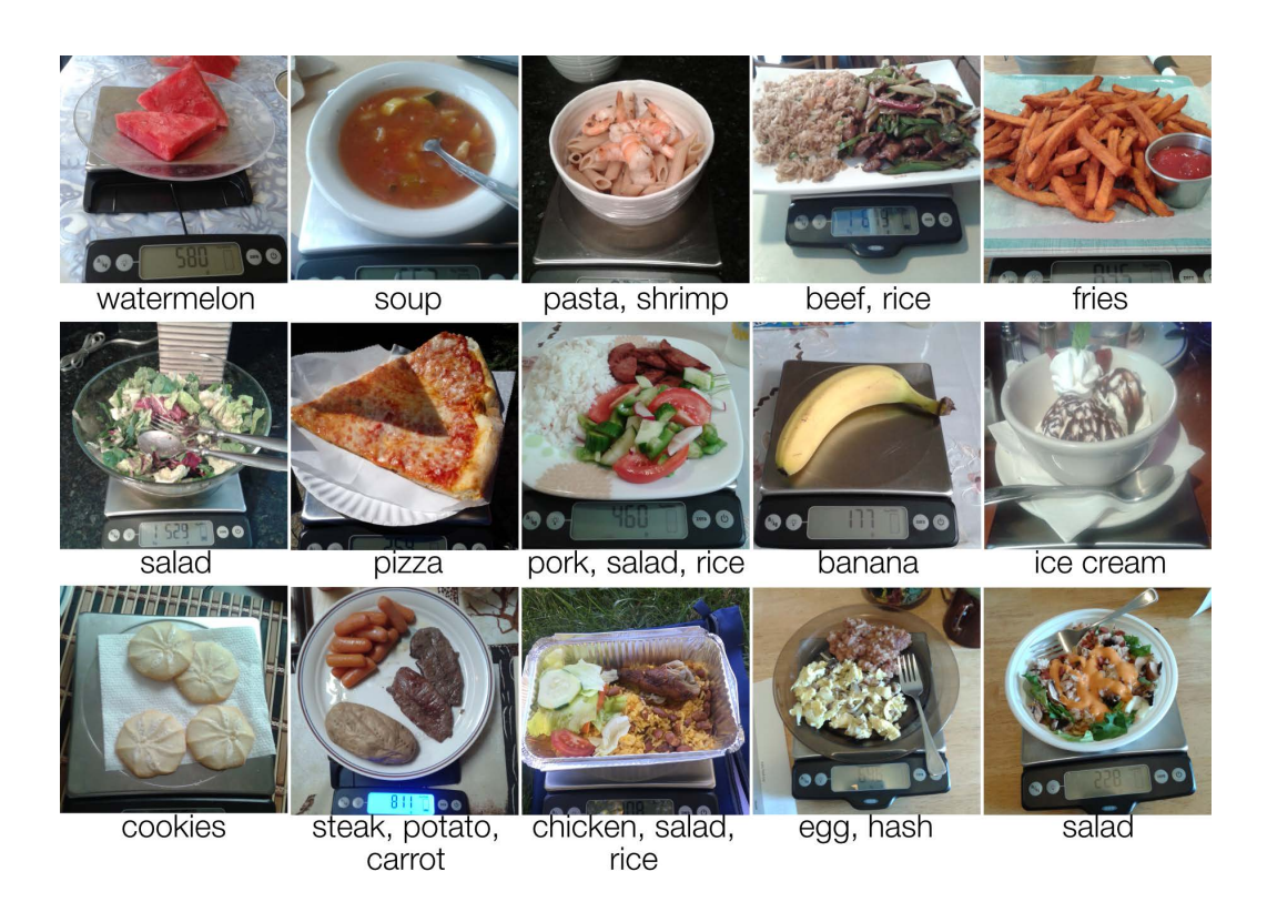
Figure 2: Examples of meals consumed by participants during free-living data collection.

65 unique foods (described further in the following section). We do not make a formal distinction between meals and snacks, and refer to all eating episodes as meals. Combining the two datasets, we have a total of 27.4h of eating and 111 meals.